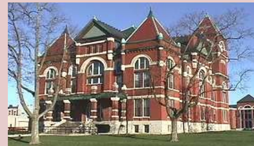
Visit our many historical attractions.

Come join us in Miami County and spend the day browsing through our many antique and specialty shops, museums, historical sites, try a round of golf or try out cable skiing at KC Watersports Skiing Lake in Hillsdale, one of only four in the United States. Hillsdale lake offers fishing, boating, camping, equestrian and nature trails on its 8,000 acres of park land. Hillsdale Lake is located at the north end of Miami County. Round out the day at one of our eating establishments and then cap off the evening with a visit to the Powell Observatory, in Louisburg, to view the cosmos or catch a movie under the stars at the Mid Way Drive In Theatre. Then retire for the night to one of our fine Bed & Breakfasts, campgrounds, or RV Parks.