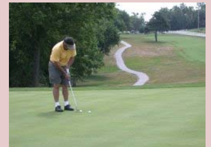
Join us at a local Golf Course